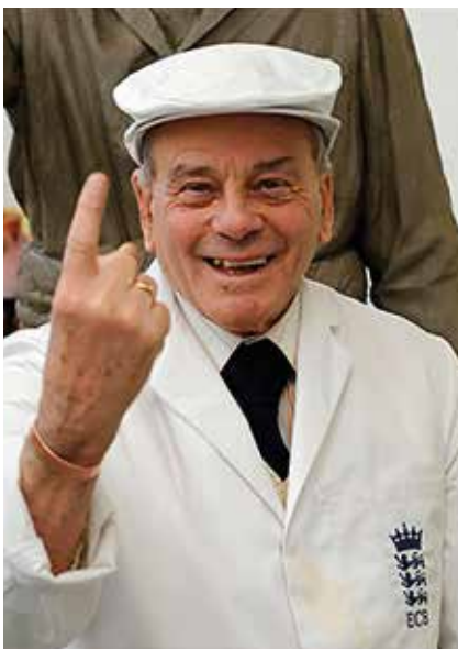
At our last site visit legendary cricket umpire Dickie Bird was in residence watching Yorkshire thrash Lancashire.

The issues surrounding education and development in practice will culminate on day 3 with the Reporting Skills and Quality Assessment master class; an afternoon's programme discussing the best practice in reporting and outlining audit processes and tools that can be used in departments keen to establish and monitor practice in a robust and educational format. Quality assessment in ultrasound practice is difficult, but the Professional Standards Group of BMUS have been working hard to devise audit tools and advice that can be used by departments which will be launched at this master class session on the final day of the ASM.