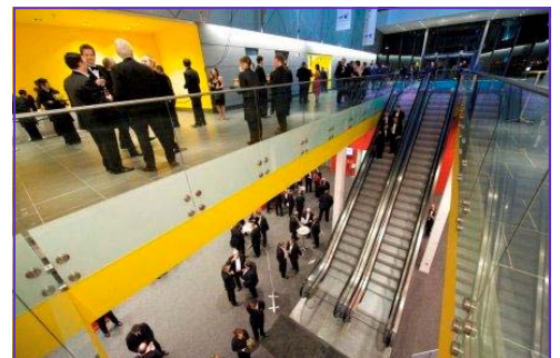
ACC Liverpool– venue for BMUS 2008